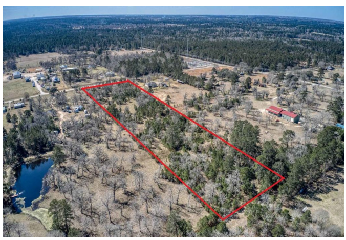
County: Waller State: Texas Zip: 77447