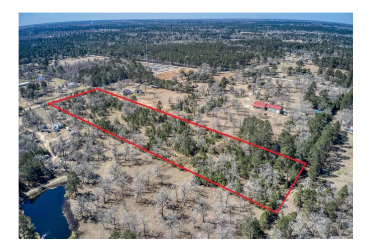
Acres: 9 List Price: $407,550 City: Hockley

8.58 unrestricted acres on quiet country road! This property is just waiting for you to build your dream home, weekend retreat or commercial business. Scattered hardwood trees offer plenty of privacy with several available spots for building/homesites. Approximately 90% of property is barbed-wire fenced. Ag exempt. Taxes are $14/yr. Currently used for cattle grazing. No flood plain! Fantastic Waller ISD schools! Conveniently located within 15 minutes of US 290 and just 10 minutes to Magnolia.